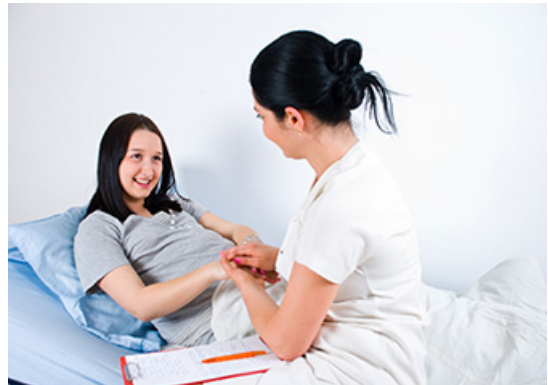
Health educators often work in hospitals. They help patients understand and adjust to their diagnosis .