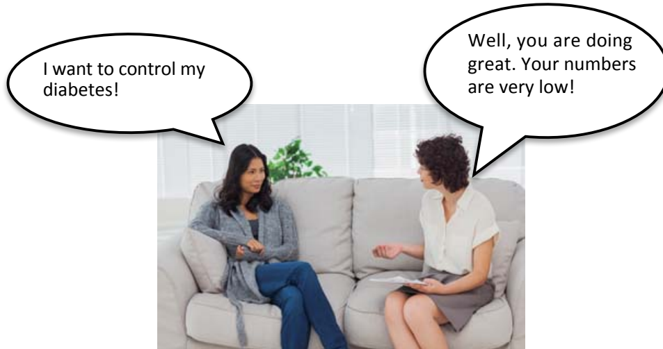
A health educator works with a patient.