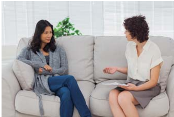
Health educators and community health workers teach people about the importance of healthy behaviors .